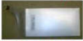
Fiber optic MB550FOS