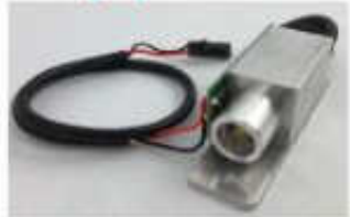
LED backlight MB550E