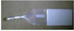
Fiber optic MB55FOL